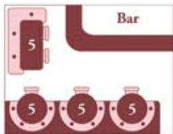
SEATING CAPACITY: 20